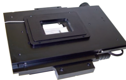
NanoScanZ Piezo Stage installed on a HI17 Flat top motorized stage