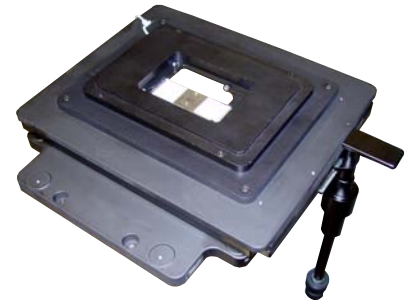
NanoScanZ Piezo Stage with adapter plate installed on a manual stage