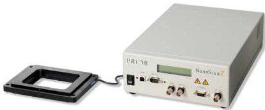
Closed loop nanodrive controller and NanoScanZ Piezo Stage System