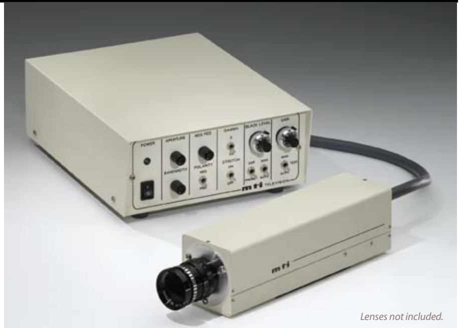
Lenses not included.

The LSC-70 series real-time video camera is ideal for applications requiring infrared sensitivity up to 2200nm. Designed for quantitative analysis, the front panel controls offer precise automatic or manual operation. Maximum contrast and optimum image sharpness is obtained through the extended gain and black level offset ranges and aperture and bandwidth controls.