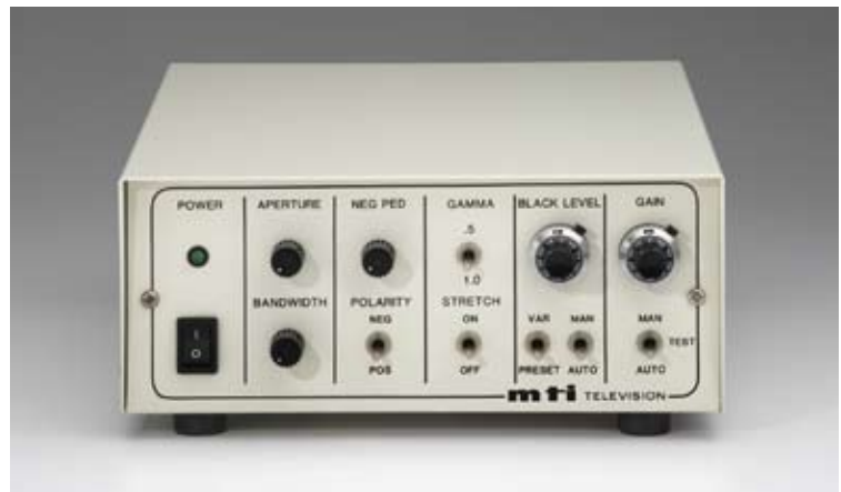
Above (left) Dage-MTI LSC 70 camera head, and (right) control panel. Lens not included.